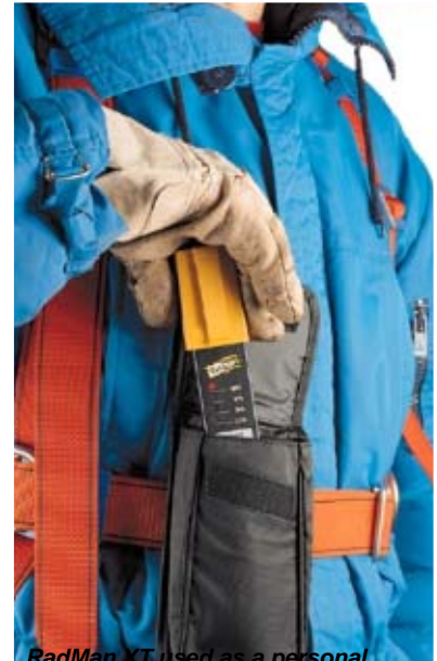
RadMan XT used as a personal monitor for radio frequency fields

As a locating unit all RadMan and RadMan XT versions can be used to locate leaks on waveguides and coaxial screw connectors (picture on the right). A non-conductive extension with handle is available as an optional accessory.