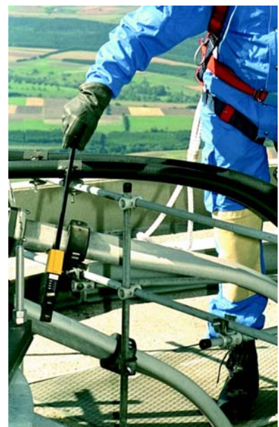
RadMan XT used as an instrument for leak detection